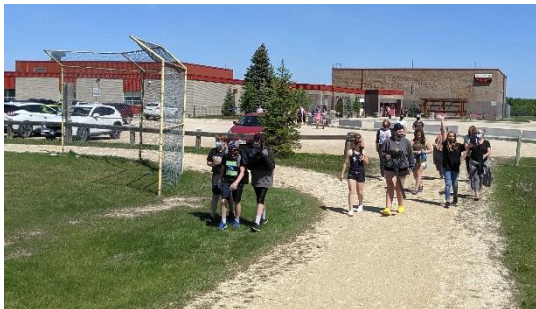
TOWN CLEAN UP

At Teulon Collegiate we believe in the following social emotional values: