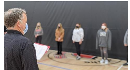
AWARDS DAY COVID STYLE