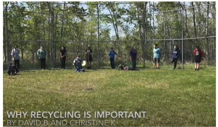
CLASS PLANNING THEIR FOREST ON SCHOOL GROUNDS