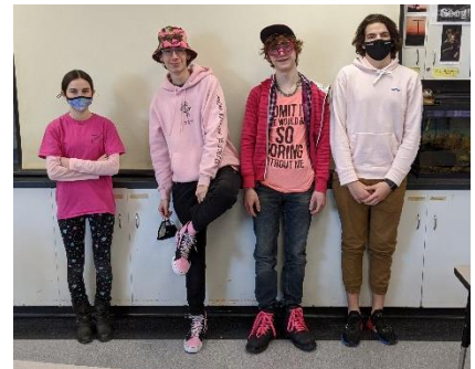
DAY OF PINK