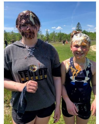
JUNE FUN DAY

Having a "Go-To-Adult" provides students with an advocate that they can turn to for social-emotional support. Our goal is to have 100% of students be able to identify a "go-to-adult". Using data from Our School Survey, the number of students in our school who identified a go-to-adult increased from the previous year. Our goal is to have 100% of students with a "Go-To-Adult". Efforts to increase the number will be a continuing goal for TCI. Many plans that were made for 2020-2021 were put on hold by COVID, but staff is hopeful to continue its pursuit of this goal in 2021-2022. Teacher Advisor Groups that were in place in 2019-2020, can hopefully be re-installed to continue building student-staff relationships. Many of our activities outlined in our Highlights section helped in this area. Staff also participated in several Divisional PD Sessions dealing with trauma, stress and coping with anxiety so that they had a better understanding of what many of their students were dealing with.