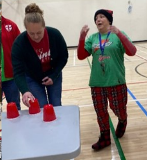
Student Council Activities Building School Spirit