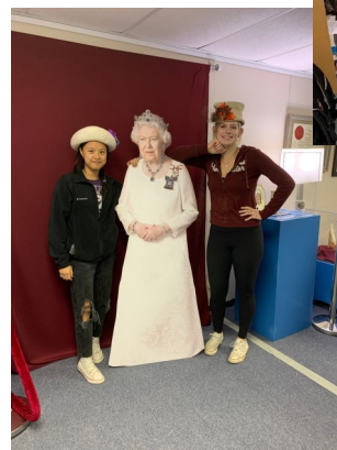
Grade 11/12 Art Field Trip