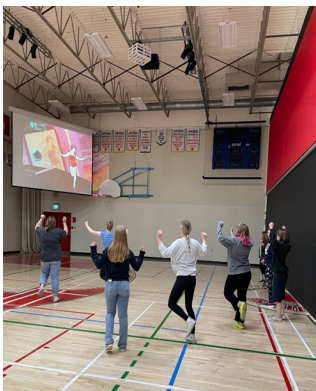
Just Dance Noon Hour-Wellness Activity