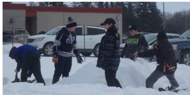
Grade 7 Science Building Quinzhees