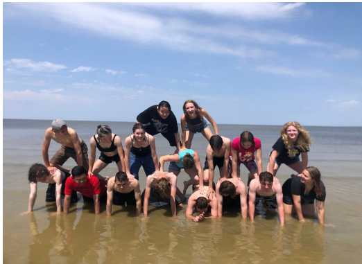
Engaging Students in their learning