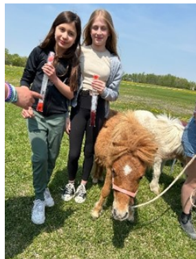
Petting Zoo Wellness