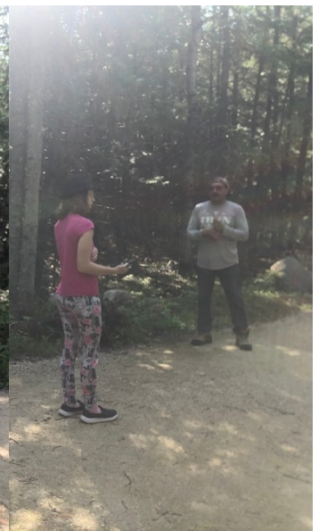
Brokenhead Wetlands Grade 10 Field Trip Indigenous Perspectives on Natural Resource Use