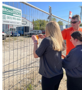
National Day of Truth and Reconciliation Activity